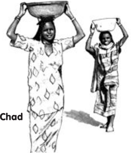
Getting water in Chad